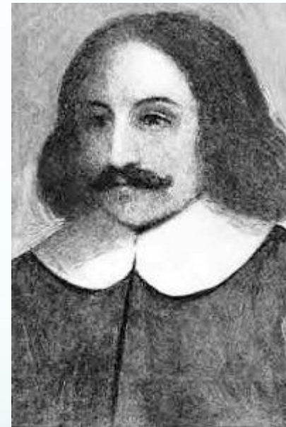
William Bradford led a small group of Puritans to the New World to escape persecution in England in 1620.